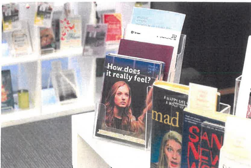
Our information guide has been distributed to GP surgeries and universities across the UK.

In order to extend our geographical reach, this guide was also developed into an interactive story-led website which contains a myth-busting quiz ( truths.mentalhealth-uk.org ). This aims to test people's knowledge of mental health, challenge user perceptions and offer contact information for more support where needed. This has been especially important for extending our impact in more isolated or remote communities. The digital guide has been accessed over 18,800 times since in launch in October 2018.